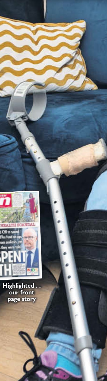
Highlighted... our front page story

Awareness & Support Ireland group - who sit on the Government's wait list task force - told the Irish Sun they would be demanding answers from CHI at its next meeting.