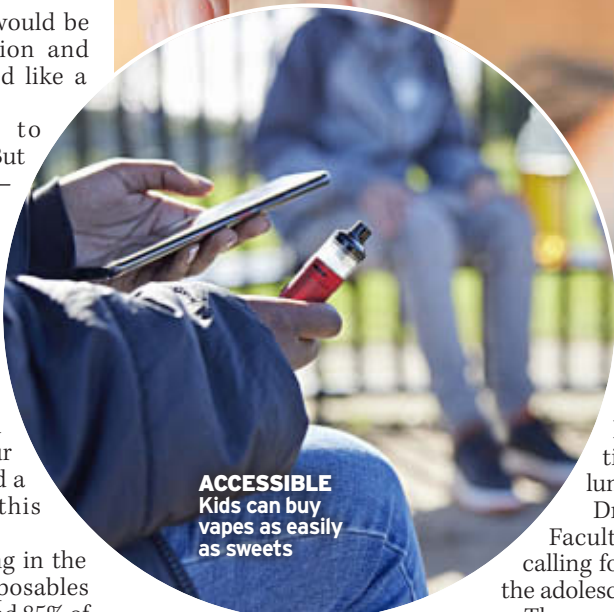
ACCESSIBLE Kids can buy vapes as easily as sweets

concentration, not sleeping at night as they're addicted to vapes."