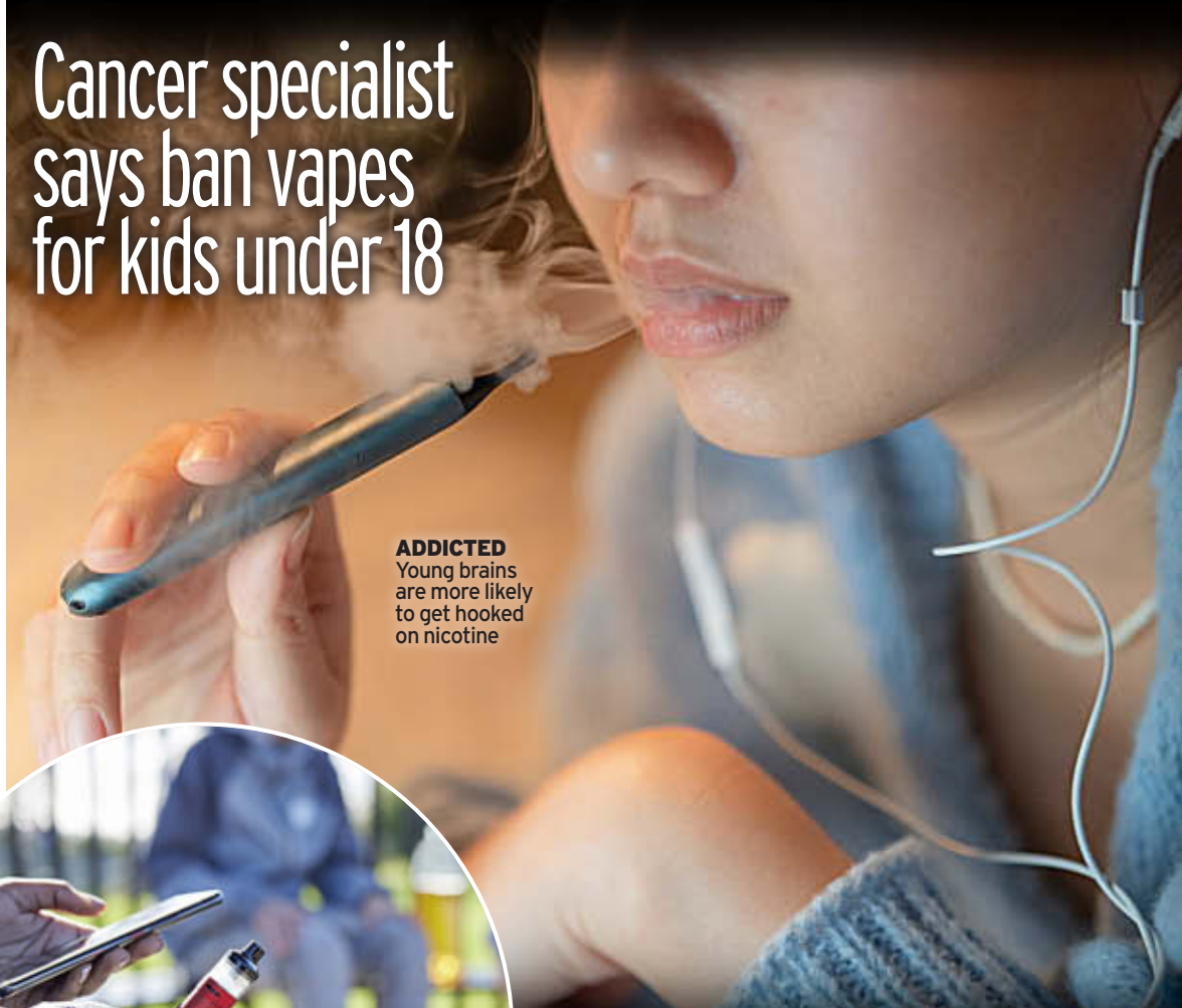
ADDICTED Young brains are more likely to get hooked on nicotine

Cancer specialist says ban vapes for kids under 18