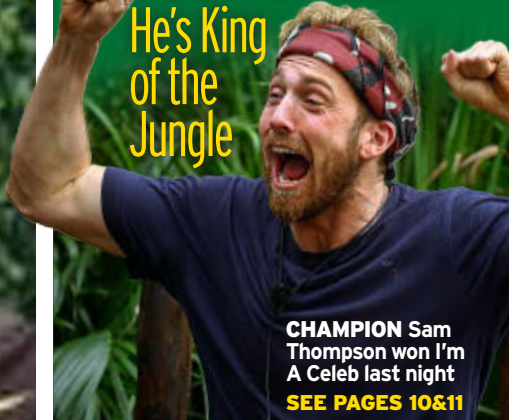
CHAMPION Sam Thompson won I'm A Celeb last night SEE PAGES 10&11