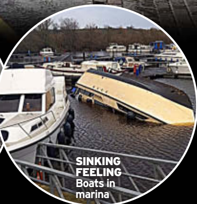
SINKING FEELING Boats in marina