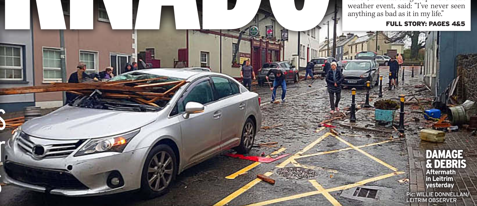
DAMAGE & DEBRIS Aftermath in Leitrim yesterday

Roofs ripped off homes & businesses as freak weather causes chaos