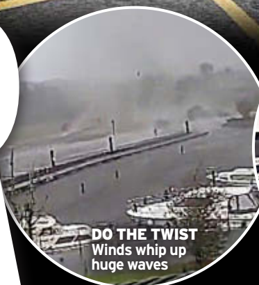
DO THE TWIST Winds whip up huge waves